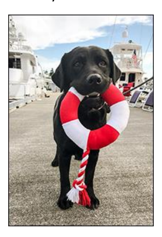
This year's winner!

A private screening of Race to Alaska , a documentary following the visceral experience of racers as they compete in one of the most difficult endurance challenges in the world and described as "the Iditarod, on a boat, with a chance of drowning or being eaten by a grizzly bear", was available for viewing. A fun Photo Booth was set up for attendees to pop in and take a selfie to post to Facebook with fun frames and filters that could be added, and a Boater's Kitchen was offered where attendees could join local chefs and get inspired by their mouth-watering cooking demos and recipes using bounty from the sea.